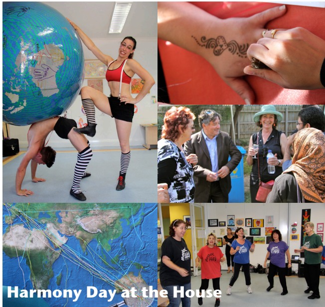
Harmony Day at the House

PPCG also co-ordinates a number of accessible recreational activities across the City of Port Phillip. For bookings and enquiries contact Shayne on 9534 0777 or call into the PPCG at the St Kilda Community Centre 161 Chapel Street, St Kilda.